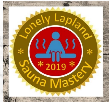
Personal Diplomas for Sauna guests

Reindeer moms got babies in May, that is also time when ice is melting away. So its time to start open water season with Original Sauna boat.